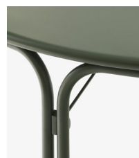
→ Bronze Green