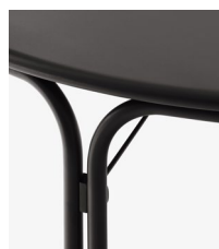
→ Warm Black